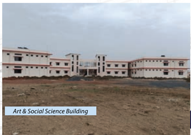
Art & Social Science Building